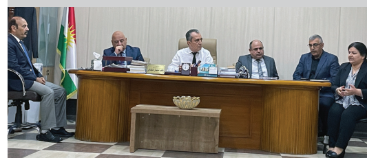
LOGDEVI Process Manager meets the judges at Duhok Juvenile Court

THESE EFFORTS MARK OUR GROUP DEDICATION TO FOSTERING SAFER ENVIRONMENTS FOR CHILDREN