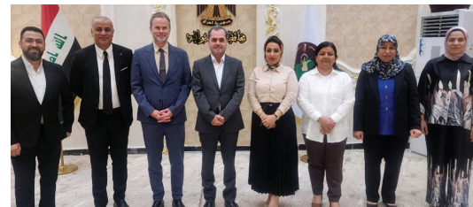
Above: SALAR International and Irfad team meeting Diwaniyah officials