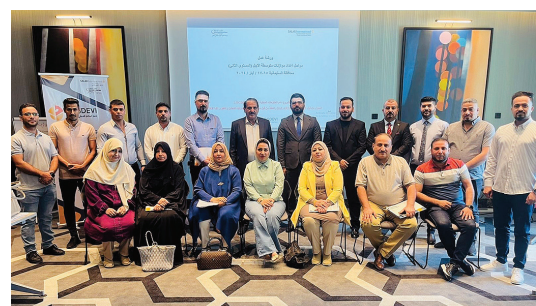
Workshop for financial staff in Diwaniyah and Muthanna

The centre aims to house an inclusive database and electronic archive, clearing the way for local planning across sectors. Additionally, it will feature a central Geographic Information Systems (GIS) to promote sectoral and spatial integration. This will facilitate impartial projects and investment distribution in the province, based on realistic foundations that promote social justice and enhance service provision to citizens.