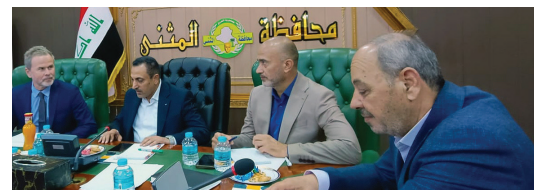
Above: SALAR International and Irfad team meet Muthanna officials