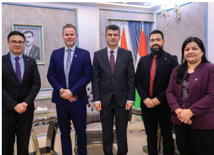
Above: SALAR International team and Irfad in a meeting with Mr Ali Tater, the Governor of Duhok

AMONG THE TOPICS DISCUSSED WITH PARTNERS WAS THE DEVELOPMENT OF A SOCIAL PROTECTION STRATEGY FOR DUHOK, AND THE SUPPORT FOR THE PROVINCIAL CHILD PROTECTION COMMITTEE, JUVENILE JUSTICE SYSTEM, AND INSTITUTIONAL GROWTH OF PARTNERS.